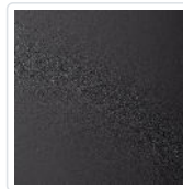
Matte Black (MB)

* For custom options, contact customer service.