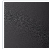
Matte Black (MB)