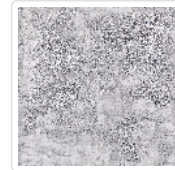
Steel Shade (SL)