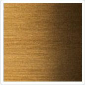
Vintage Brass (VB)