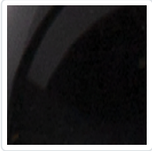
Glossy Black (GBK)