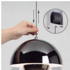
Retractable Wire System