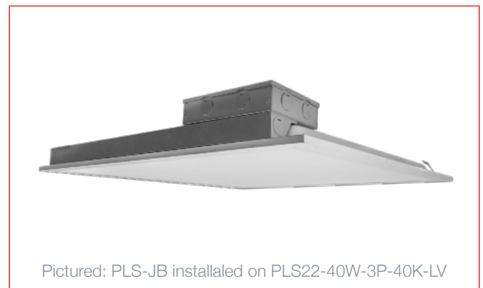
Pictured: PLS-JB installed on PLS22-40W-3P-40K-LV