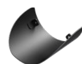
Visor SOLD SEPARATELY (BL01-VISOR)