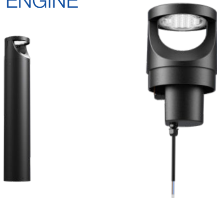
*PICTURED WITH BASE POLE (SOLD SEPARATELY) BL01-14W-4P-3CCT-UD