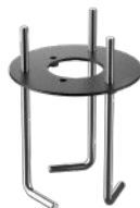
Anchor Bolts & Plate SOLD SEPARATELY (BL01-PLATE)

WET CONCRETE INSTALLATION: Anchor Bolts & Plate (BL01-PLATE) are required for wet concrete installation.