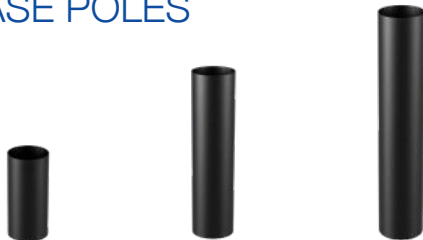
BL01-BASE19 BL01-BASE35 BL01-BASE42

Choose from 19", 35", and 42" Base Poles