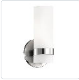
WS9809-BN Brushed Nickel