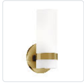
WS9809-BG Brushed Gold