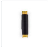
WS41216-BK/GL Black/Gold Leaf