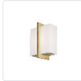
WS39210-BG Brushed Gold