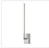
WS25118-BN Brushed Nickel