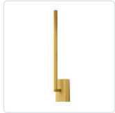
WS25118-BG Brushed Gold