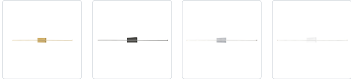
WS18248-BG Brushed Gold

Following the success of the Vega family is the next evolution of the line, Vega Minor. The diminutive square linear profile envelops and radiates a soft uniform light in a diverse spectrum of lengths and unique configurations. Refined details with crafted finishes augment the reductive silhouette of the expanded collection.