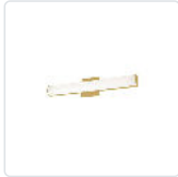
VL61220-BG Brushed Gold