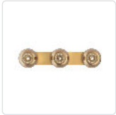
VL57532-BG/CP Brushed Gold/Copper