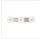
VL57532-CH/OP Chrome/Opal Glass