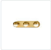
VL47321-BG Brushed Gold