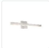
VL10323-BN Brushed Nickel