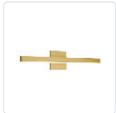
VL10323-BG Brushed Gold