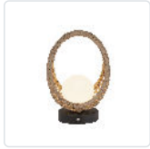
TL20610-BK/OP Black/Opal Matte Glass