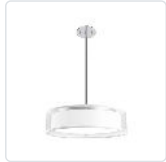
PD7916-WOR-5CCT White Organza