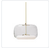
PD70615-CL/BG Clear/Brushed Gold