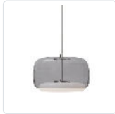
PD70615-SM/BN Smoked/Brushed Nickel