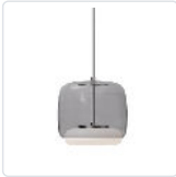
PD70610-SM/BN Smoked/Brushed Nickel