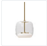
PD70610-CL/BG Clear/Brushed Gold