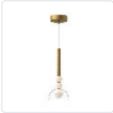
PD30502-BG/CL Brushed Gold/Clear