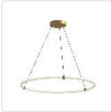
PD24748-BG Brushed Gold