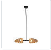
PD20602-BK/OP Black/Opal Matte Glass