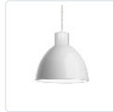
PD1709-WG Glossy White