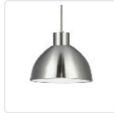
PD1709-BN Brushed Nickel