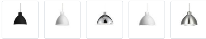
PD1706-BK Black PD1706-WG Glossy White PD1706-CH Chrome PD1706-WH White PD1706-BN Brushed Nickel