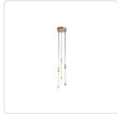
MP75213-BG Brushed Gold