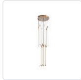
MP75127-BG Brushed Gold