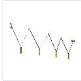
LP90404-VB Vintage Brass