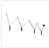
LP90404-UB Urban Bronze