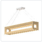
LP32942-WK White Oak