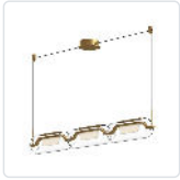
LP28543-BG Brushed Gold