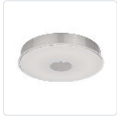
FM7616-BN-5CCT Brushed Nickel