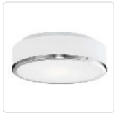
FM6012-BN-5CCT Brushed Nickel