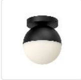
FM58306-BK/OP Black/Opal Glass