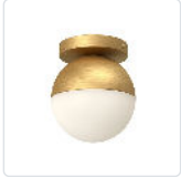
FM58306-BG/OP Brushed Gold/Opal Glass