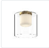
FM53509-BG/CL Brushed Gold/Clear