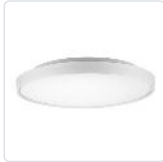
FM43522-WH- 5CCT White