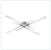
FM18247-BN Brushed Nickel