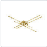
FM18247-BG Brushed Gold