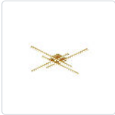
FM18232-BG Brushed Gold