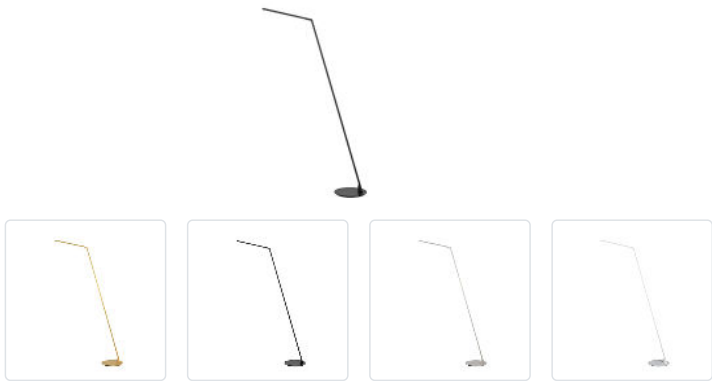
FL25558-BG Brushed Gold