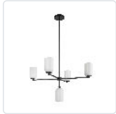
CH57731-BK/GO Black/Glossy Opal Glass