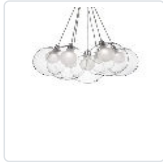
CH3117-CL Clear Glass