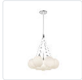
CH3117-OP Opal Glass