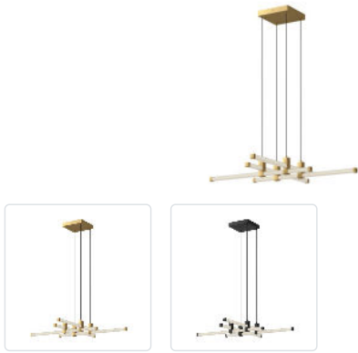
CH23534-BG Brushed Gold