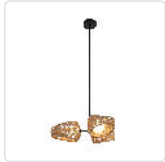
CH20625-BK/OP Black/Opal Matte Glass