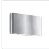
AT68010-BN Brushed Nickel