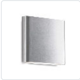
AT68006-BN Brushed Nickel