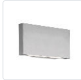
AT67010-BN Brushed Nickel