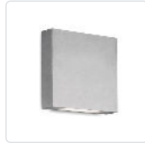
AT67006-BN Brushed Nickel