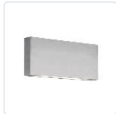
AT6610-BN Brushed Nickel