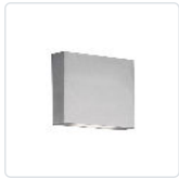
AT6606-BN Brushed Nickel