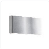
AT6510-BN Brushed Nickel