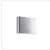
AT6506-BN Brushed Nickel