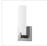
601484BN-LED Brushed Nickel