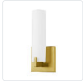
601484BG-LED Brushed Gold